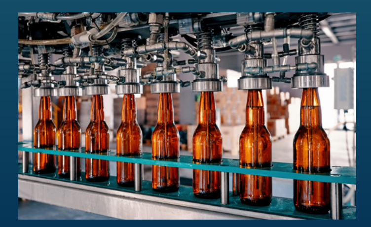
Count on consistent product temperature control and operational reliability.